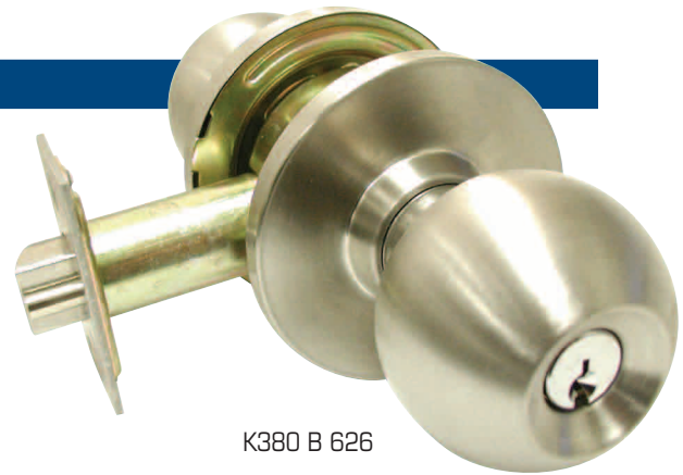
K380 B 626

Standard-duty commercial lockset suitable for interior and exterior doors of office buildings, hotel / motel, storefronts, multi-family housing, retail, and government facilities.